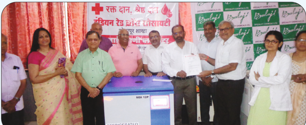
Sponsor of Centrifuge Machine 12 Cups Cat No MDIRC 70 With Stabilizer under CSR Initiative to Indian Red Cross Society Solapur Dist. Branch Smt. Gopabai Damani Blood Centre