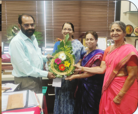
Financial Assistance to Backward Class Girls Hostel, Solapur to provide grains and necessities for Girls Hostel under CSR Initiative.