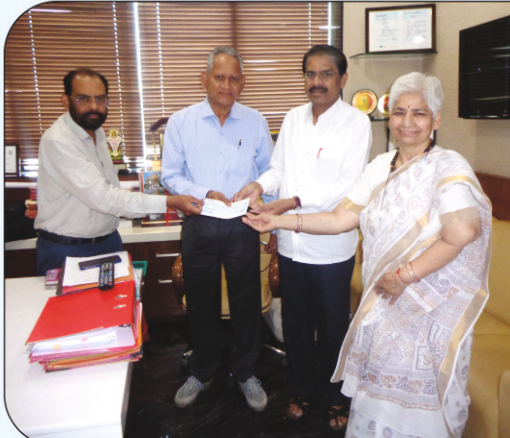
Financial Assistance to Pakhar Sankul Balgruh Dindur, Solapur for construction of Building for the Orphanage